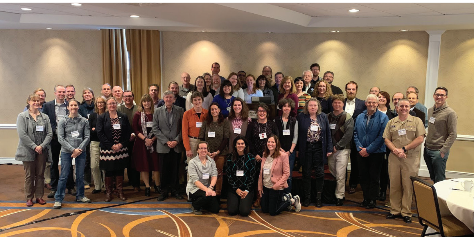
FIGURE 1. The ASPIRE Science Planning Workshop in Silver Spring, MD had over 50 attendees representing interests in Atlantic Ocean basin exploration and research from the U.S., Canada, European Union, Iceland, and Russia.

On November 15-16, 2018, over 50 experts in deep-sea exploration convened in Silver Spring, Maryland to discuss North Atlantic Ocean exploration interests and priorities as part of the NOAA Office of Ocean Exploration and Research (OER) Atlantic Seafloor Partnership for Integrated Research and Exploration (ASPIRE) Science Planning Workshop (Figure 1). Participants consisted of a mix of early to late career professionals and represented diverse backgrounds and interests from academia, industry, and government from across the United States, European Union, Iceland, Russia, and Canada. The objectives of the workshop were to determine Atlantic Ocean-based mapping and characterization needs from a variety of deep-sea exploration interests. Workshop outputs will guide exploration in the North Atlantic Ocean in 2019-2021, both through the development and execution of NOAA Ship Okeanos Explorer field seasons and through external partnerships with government, academia, industry, and non-governmental organizations. ASPIRE workshop results are intended to be used to inform other expeditions and platforms that are planning cruises in the North Atlantic.