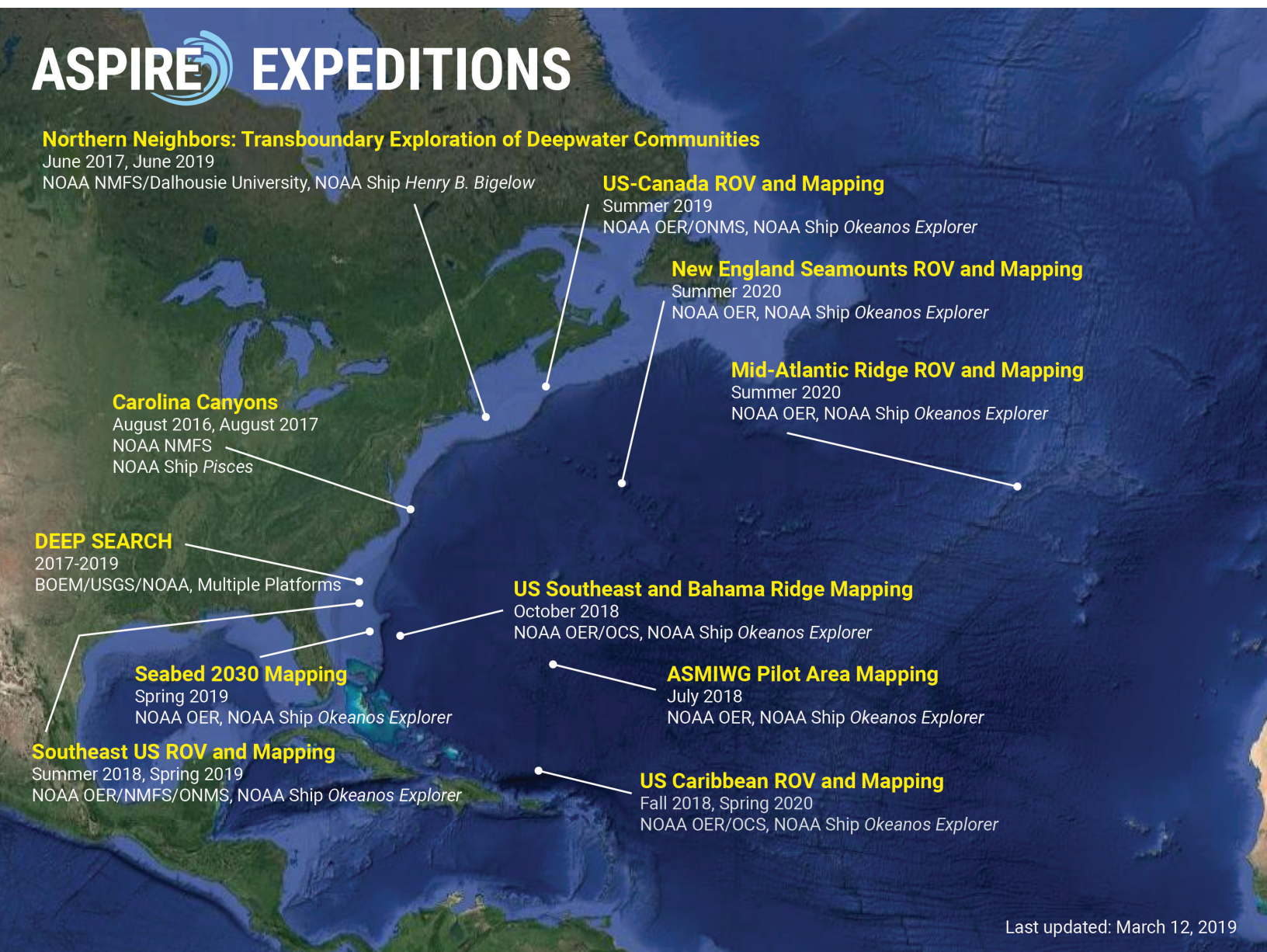
FIGURE 2. This map of the North Western Atlantic Ocean basin identifies all expeditions from 2016-2020 that fall under the auspices of the ASPIRE campaign. Expeditions for 2021 are in the early planning stages and are not shown in this figure.

ASPIRE under the Galway Statement on Atlantic Ocean Cooperation, is a multi-year, multi-national collaborative campaign to explore and characterize the North Atlantic Ocean. Building on the successes of NOAA's 2012-2013 Atlantic Canyons Undersea Mapping Expeditions (ACUMEN), the ASPIRE campaign broadens both the geographic focus to include more of the U.S. Atlantic and the high seas. ASPIRE also broadens the scope of partnerships to include federal agencies, such as BOEM and USGS, as well as international partners from the European Union and Canada. Fieldwork thus far has included missions to explore the submarine canyons of the U.S. and Canadian Atlantic continental margins, characterize the sensitive habitats of the U.S. mid- and South Atlantic, and map deepwater areas within international waters supporting the Atlantic Seabed Mapping International Working Group (ASMIWG). NOAA Ship Okeanos Explorer began working in the region in 2018 and has so far completed six ASPIRE missions (Figure 2). While these efforts are coordinated at the project-level, the ASPIRE Workshop was convened to better facilitate collaborative planning and develop a cohesive set of exploration priorities to work toward for the remainder of the ASPIRE campaign.