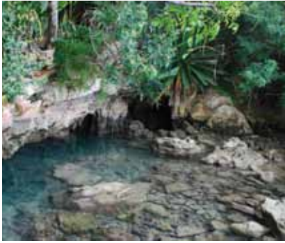
Entrance to one of Bermuda's caves.